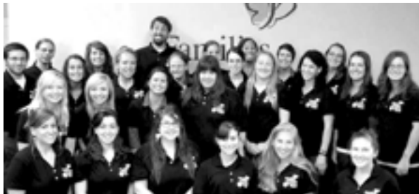
Families in Transition VISTA Program 2013

The Families in Transition VISTA Program is run by Families in Transition (FIT), a Manchester- and Concord-based homeless housing and services provider. Families in Transition partners with organizations across the state to provide work sites for VISTAs. It also recruits new VISTAs and offers supervision by hosting FIT VISTA monthly meetings, tracking VISTA progress, and offering general support throughout the VISTA service year.